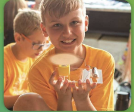
A sixth grader gains confidence as he builds a robot to make awesome spin art!