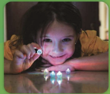
A second grader builds persistence by testing how marbles move through her arcade design!