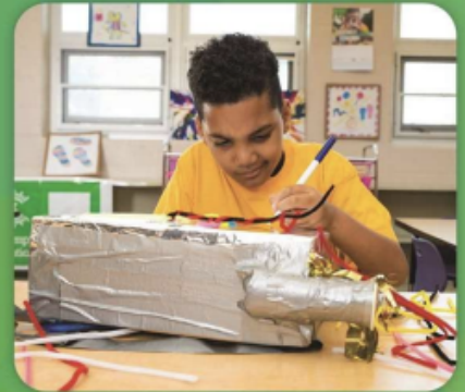
A fourth grader uses problem-solving skills to create a Spacepack for a galactic journey!