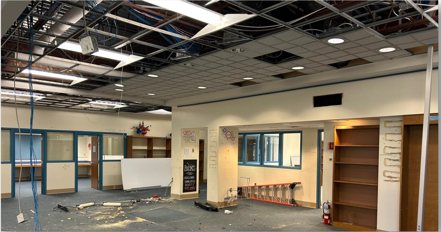
Figure 1 Current circulation area being opened up for reconfiguration as the area will be transformed into a media hub servicing a wide array of programs including enhanced student performance areas, large group meeting space, learning centers, maker space classroom and Lab.