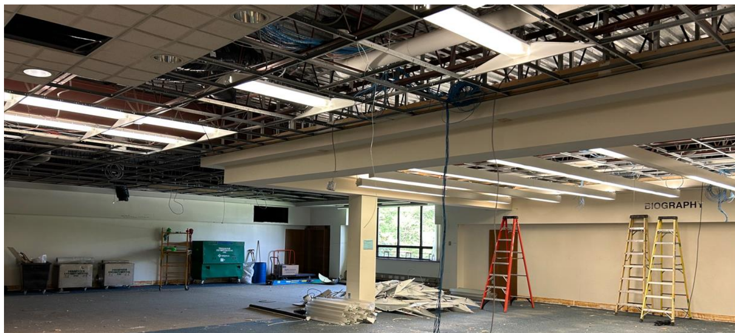
Figure 2. Area designated for student work area, maker space lab (far corner) and student seating area (right front) providing the ability for passive (quiet areas) adjacent to active zones such as the Makerspace /Stem Lab.— Again this concept/design will allow our students to foster creativity, problem-solving, and collaboration in a hands-on environment. The final plan will provide a space for students to experiment with new ideas, build tangible projects, and develop essential skills for the future.